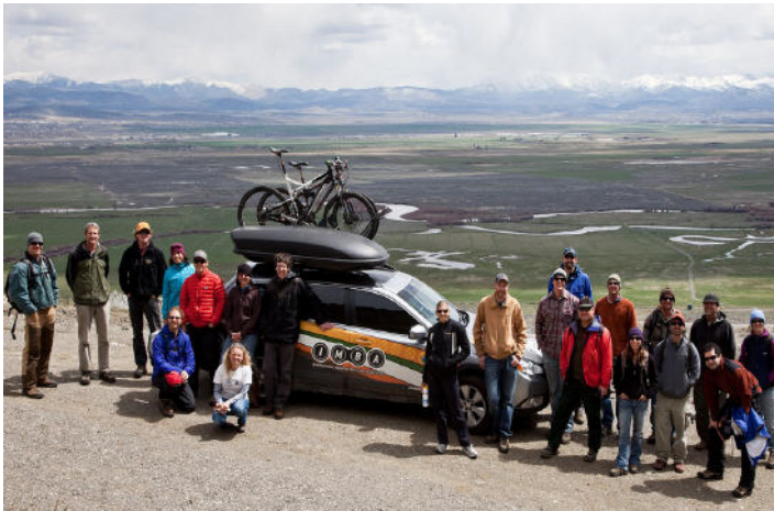
The IMBA Trail Care Crew visit in April was our first trail work this year. The IMBA crew taught several classes and then we went down to Genoa to help Carson Valley Trails Association break ground on the Sierra Canyon Trail project.

A late start to the season due to snow did not stop us from riding and working on many well loved multi-use trails this year. In July, we signed a Volunteer Service Agreement with the Forest Service which enabled us to hold trail building days on multi-use trails within the Tahoe Basin. Working with the tools and crew leaders from the Forest Service we were able to construct, build and most importantly provide mountain biker input for features and trail design on Armstrong Connector Trail, Corral Trail, Christmas Valley Trail, Tyrolean Downhill, and Toads (Saxon Creek). The trail building days were held on weekends with the number of TAMBA volunteers that showed up each time ranging from 15 to 30 people. In the spirit of keeping the days fun, we provided free lunch and free post work BBQ complete with beer for the volunteers. At a few events, schwag donated by local businesses was given out to volunteers.