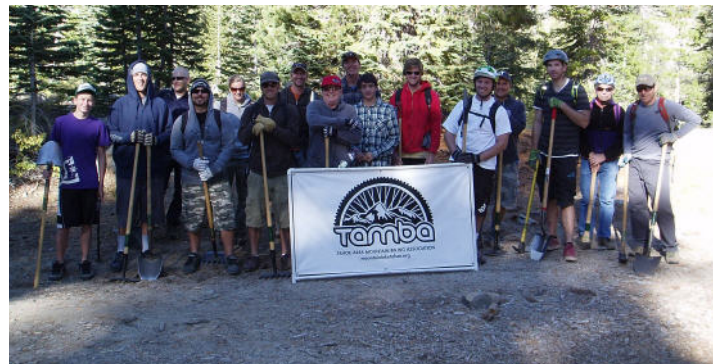
Volunteers on the Tyrolean Trail Day in October

Getting dirty with friends to keep our trails alive and healthy is fun and makes the riding here that much better - please stay tuned next summer to get involved and give back to this amazing network of trails that Tahoe has to offer. To be able to give rider input is a privilege and honor. In the meantime, if you have ideas or suggestions, please send an e-mail to trails@mountainbiketahoe.org .